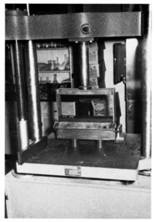
FIG. 2 Beam Extraction Assembly

tamping foot. Place three sheets of 3\frac{1}{4}(82.6) by 15-in. (381-mm) paper on the mold base plate. Maintain the compactor foot sufficiently hot prevent the mixture from adhering to it.