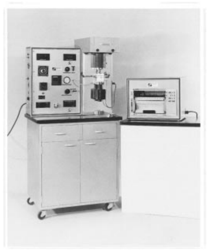
FIG. 3 Falex Variable-Speed Four-Ball Wear Test Machine