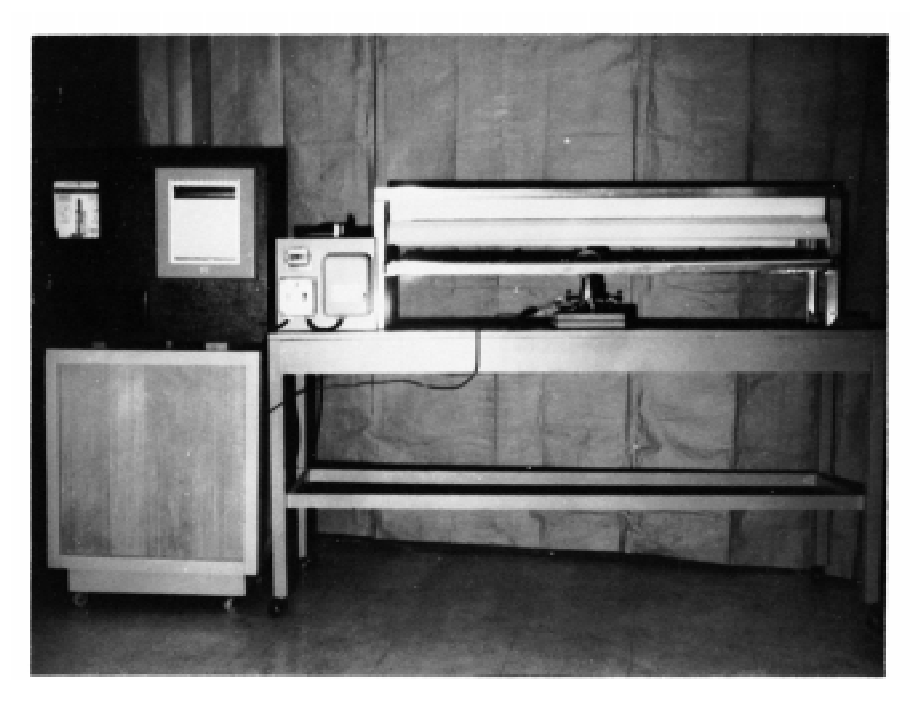
Note 1—Pyranometer, recorder, and demand readout meter in place. FIG. A1.3 Single-Bank Device of Four Verilux Daylight Fluorescent Lamps <sup>6</sup> that Handles Twenty-seven 3 by 6-in. Panels

A1.2 Cabinet Construction—Make framework for the apparatus out of 1\frac{1}{2} by 1\frac{1}{2} by \frac{1}{8} -in. (40 by 40 by 3.2-mm) aluminum angle available in hardware stores. The supports and the remainder of the enclosure are ½-in. tempered hardboard. The exposure panel supports, which are also the apparatus sides, are made removable by being fastened by reversed bolts with wing nuts. Coat them on the interior side with a non-yellowing white paint. Four reflectors, which each can hold four fluorescent lamps, are fastened together by the 1½-in. angles, back to back, to form a square in the center of the cabinet facing the specimens, which are attached to the hardboard panels support as shown in Fig. A1.4. Construct the framework so that the lamps are 3 in. (75 mm) from the test specimens. Cut holes in each side adjacent to the center and centered on a panel location to accommodate an Eppley pyranometer. With one panel space missing on each panel bank, the cabinet accommodates 108 test panels.