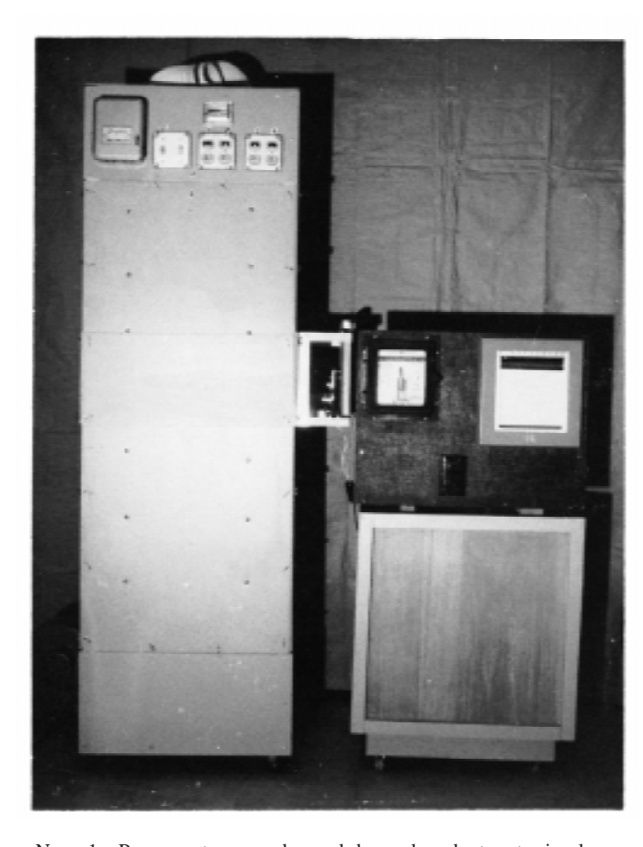
Note 1—Pyranometer, recorder, and demand readout meter in place. (a) Four-Bank Fluorescent Exposure Apparatus that Handles One Hundred and Eight 3 by 6-in. Panels