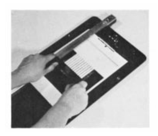
Note 1—Note use of straightedge guide. FIG. 4 Drawing Down with the Anti-Sag Meter