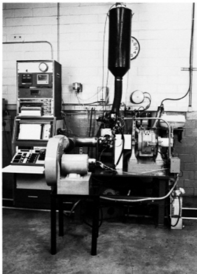
FIG. 1 Test Stand

developed. If this model is not available check the suitability for this test of available models with the manufacturer. 8