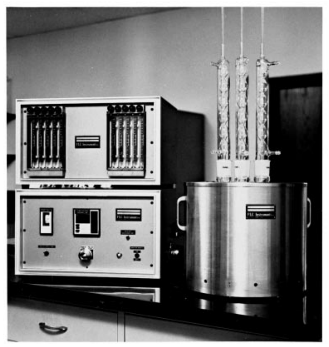
FIG. 1 Universal Oxidation Test Apparatus

5.1.4 The block is cylindrical and constructed from forged aluminum. The block has a minimum thickness of 38 mm of insulation on all sides, top and bottom. An insulation of thermally efficient ceramic fiber material is suggested.