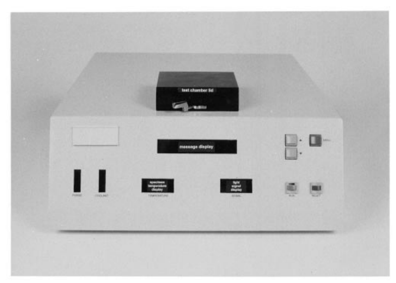
FIG. A1.3 Apparatus Exterior

ASTM International takes no position respecting the validity of any patent rights asserted in connection with any item mentioned in this standard. Users of this standard are expressly advised that determination of the validity of any such patent rights, and the risk of infringement of such rights, are entirely their own responsibility.