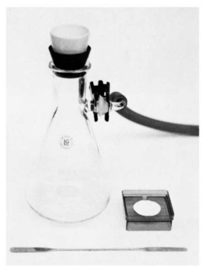
FIG. 2 Filtration Apparatus

panel (the CIE<sup>10</sup> tristimulus Y value) for CIE Source C (daylight), using an instrument that integrates diffuse and specular reflectance by means of a hollow integrating sphere, calibrated according to the manufacturer's instructions using a Gardner Laboratory Gray-White Reflectance Standard with a CIE tristimulus Y value of 40. Take at least three readings on different areas of each panel and calculate the mean luminous reflectance for each panel. Report the luminous reflectance of the coating sample as the mean of the two panel values to the nearest 0.5 %.