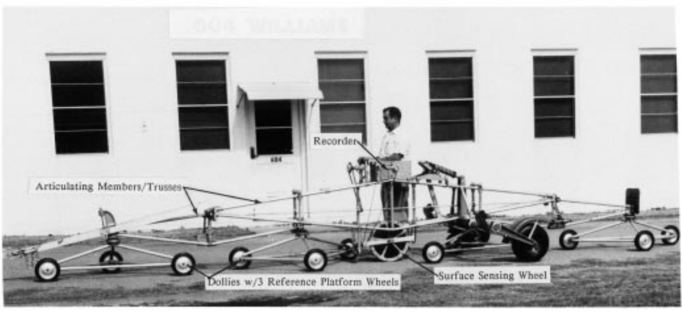
FIG. 1 Typical Profilograph