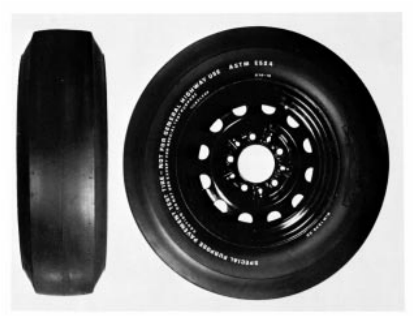
FIG. 1 Test Tire